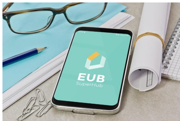
Project logo example (illustration)

The unique project visual elements have been designed specifically for the project dissemination and communication goals. The major items of the visual ID are ready and the project related materials, including the website, are developed accordingly.